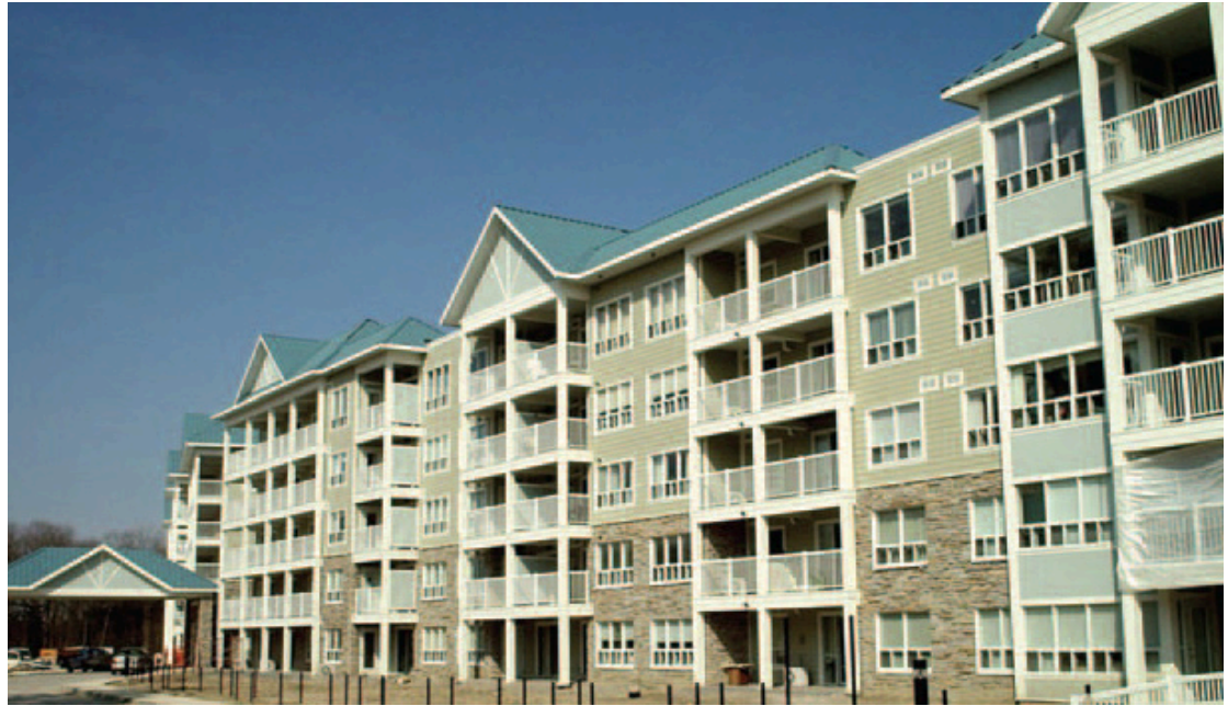
Bogart Pond Condominium Phase 1 nearing completion.

Just as beauty is in the eye of the beholder, so potential is in the eye of the imaginative. There are still folk out there who hear words like “pre-engineered” and “system” and think that translates to “box” - with self-imposed limits on both usefulness and appearance.