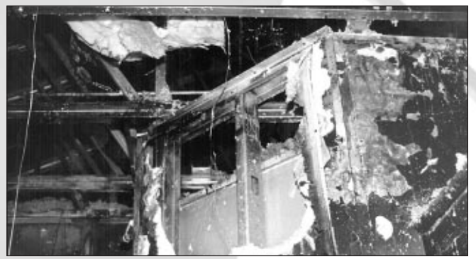
Charred steel studs from 1996 Brentwood, CA home fire maintained structural integrity.

For comparison purposes, most specifications call for greater than 33ksi yield strength for structural studs. "The fire," Simko continued, "seems to have had little effect on the mechanical properties of these members." Further testing produced evidence which indicated the "retention of mechanical strength in spite of the fire and furthermore suggests that the zinc coating remained on the surface," said Simko. "In some places, the zinc coating alloyed with the substrate to create a lightly iron-rich 'galvannealed' coating."